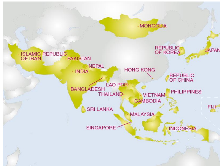
APO member economies

The current membership comprises 20 economies, rich in ethnic, cultural, social, and religious diversity and with unique strengths and needs for productivity enhancement and socioeconomic development. At the same time, these economies pledge to assist each other in their productivity drives in a spirit of mutual cooperation by sharing knowledge, information, and experience.